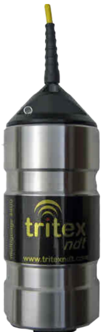
Multigaugage 4400 4000 m