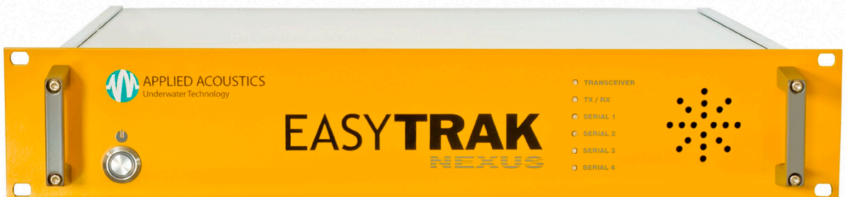
Easytrak Nexus Command Console

Applied Acoustic Engineering Ltd Marine House, Marine Park Gapton Hall Road Great Yarmouth NR31 0NB United Kingdom